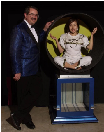
The Drum of Shadows

Divinity degree from the Southwestern Baptist Theological Seminary in Fort Worth, Texas.