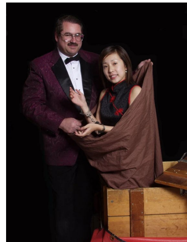
The Houdini Trunk Trick

We also need communication support. Our best advertising comes through word of mouth. Please tell churches about our ministry and website. Anyone can download our brochure and other media from our website free if charge. It is easy to e-mail it or print it with any computer printer. If needed, please contact our offices for more information or assistance.