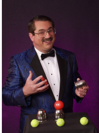
Is the Hand Quicker Than the Eye?

Illusions generate within people a sense of mystery, excitement, and anticipation. Illusion performances used in conjunction with church-related activities draws both saved and unsaved individuals to those functions who otherwise might never come. Our programs